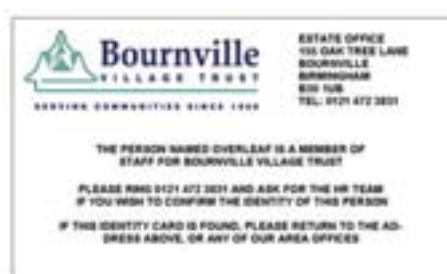
• The layout of the new ID cards