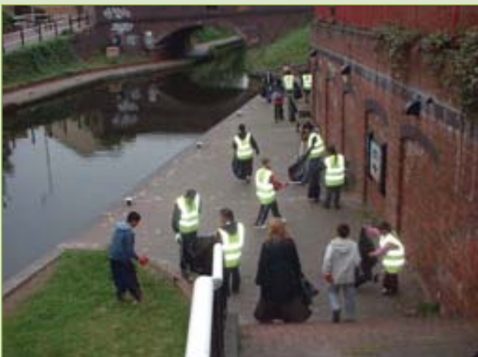
• Youngsters helped tidy up the canal area

Over 30 teenagers from Phoenix Hall Youth Club in Bordesley Village took part in a litter pick.