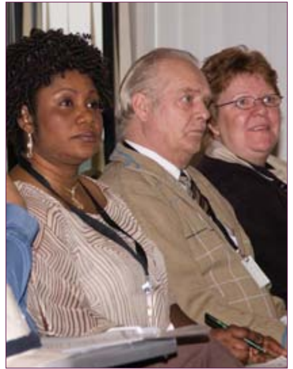
• There are a range of benefits in working together

Such associations are groups formed by local people who join together to work towards common aims. These groups enable people to work together to improve their neighbourhood, empower those who join with new skills and confidence, and produce a positive community spirit.