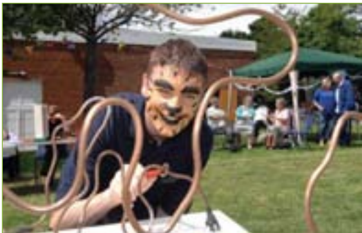
• MUGA was designed with young people in mind

To help celebrate the MUGA's official opening, BVT hosted a community Fun Day from 2pm which included circus acts, stalls, a barbecue, face painting, a bouncy castle, and a tug-of-war. In addition, Green Meadow School organised a five-a-side football tournament. The winning team was representing Sport England against a team representing the Trust. It is estimated that an extra 2,000 people per year will take part in sport and recreational activities thanks to the new MUGA.