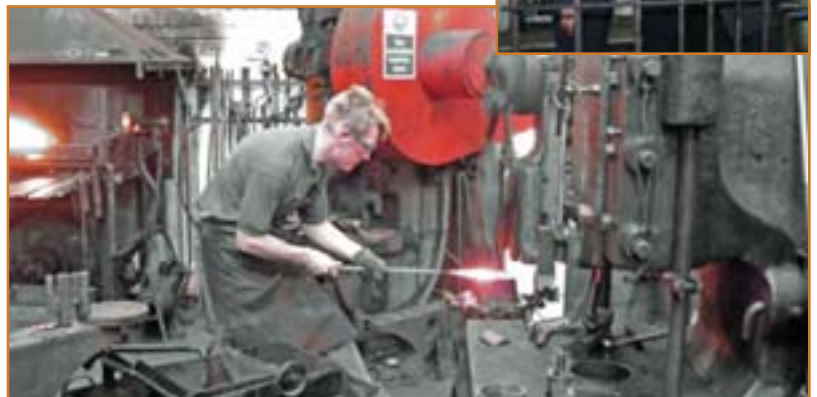
• Work has involved using many traditional skills