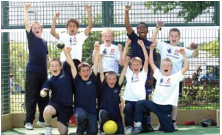
• It was all smiles as youngsters took part in a host of activities

The MUGA was designed to appeal to young people in particular as there is very little for them to do in the area. Facilities include a children's play area, provisions for football and basketball, park benches, floodlights, and features for those with disabilities.