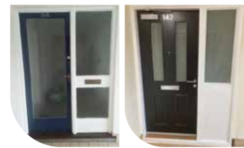
Fire doors transformed at flats in Mulberry Road. Before and after doors have been changed