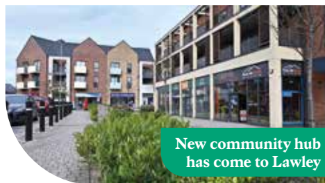
New community hub has come to Lawley