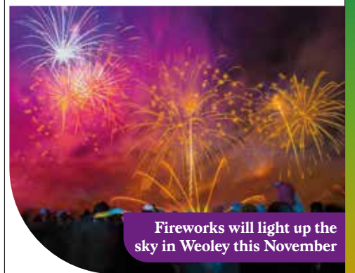
Fireworks will light up the sky in Weoley this November

Advance tickets cost £8 for adults, £3 for children (under two's are free) and can be bought at Shenley Court Hall from 9th October on Mondays, Tuesdays and Wednesdays between 10am and 4pm or from Weoley Hill Village Hall from 10th October on Tuesdays between 6.30pm and 7.30pm or Saturdays 10am-12pm. Tickets can also be purchased on the day and cost £10 for adults and £5 for children.