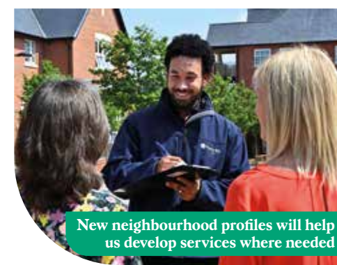
New neighbourhood profiles will help us develop services where needed

If you're a member of a local group, charity or organisation and would like to get involved in neighbourhood profiles and plans, or are a BVT resident and want to know more, email communityadmin@bvt.org.uk or call 0300 333 6540.