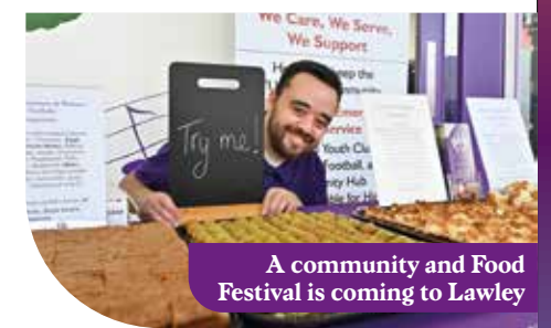
A community and Food Festival is coming to Lawley

We are also excited to be developing new activities and events for 2024 including events that will celebrate Chinese New Year, Eid, Pride Month, Black History Month, Easter and many more. If you would like to host, promote or share ideas for an event you would like to see take place in your neighbourhood, please get in touch with us at communityadmin@bvt.org.uk (if you live in Birmingham), lawleystewardship@bvt.org.uk (if you live in Lawley) or lightmoorstewardship@bvt.org.uk (if you live in Lightmoor).