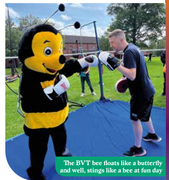
The BVT bee floats like a butterfly and well, stings like a bee at fun day

Birmingham Community Boxing Project offered boxing taster sessions, there were giant games to play, face-painting, keep fit sessions and Shenley Court Hall also held a craft fayre.