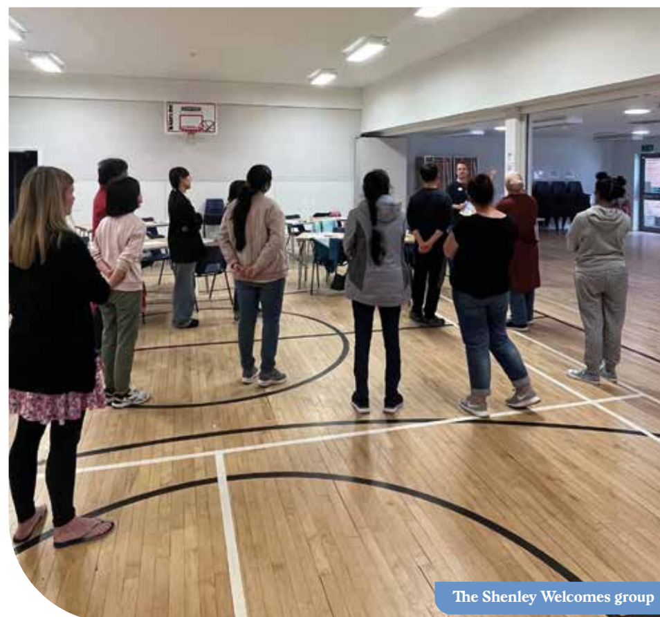
The Shenley Welcomes group

Want to learn more and get involved? If you live or operate a group in Birmingham, email communityadmin@bvt.org.uk . If you live in Lawley or Lightmoor please email lawleystewardship@bvt.org.uk or lightmoorstewardship@bvt.org.uk