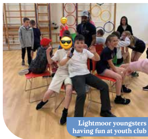
Lightmoor youngsters having fun at youth club

pleased to be working as part of the Lightmoor Village Delivery Group with Shropshire Youth Association to provide a range of opportunities for young people to safely spend time together and be part of the wider community they live in."