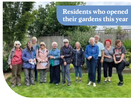
Residents who opened their gardens this year

Seven residents and local charity Masefield Community Garden took part in the National Garden Scheme in July, giving visitors unique access to their gardens. The event raised £4,906.42 for National Garden Scheme nursing charities and £788 for other good causes.