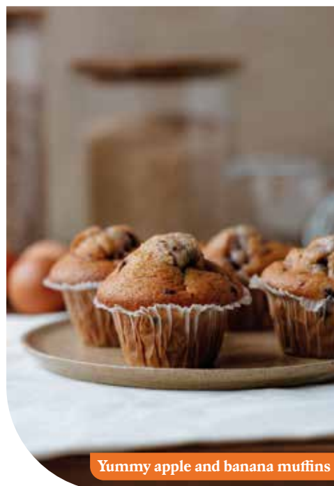
Yummy apple and banana muffins

Recipe courtesy of NHS Better Health, Healthier Families www.nhs.uk/healthier-families