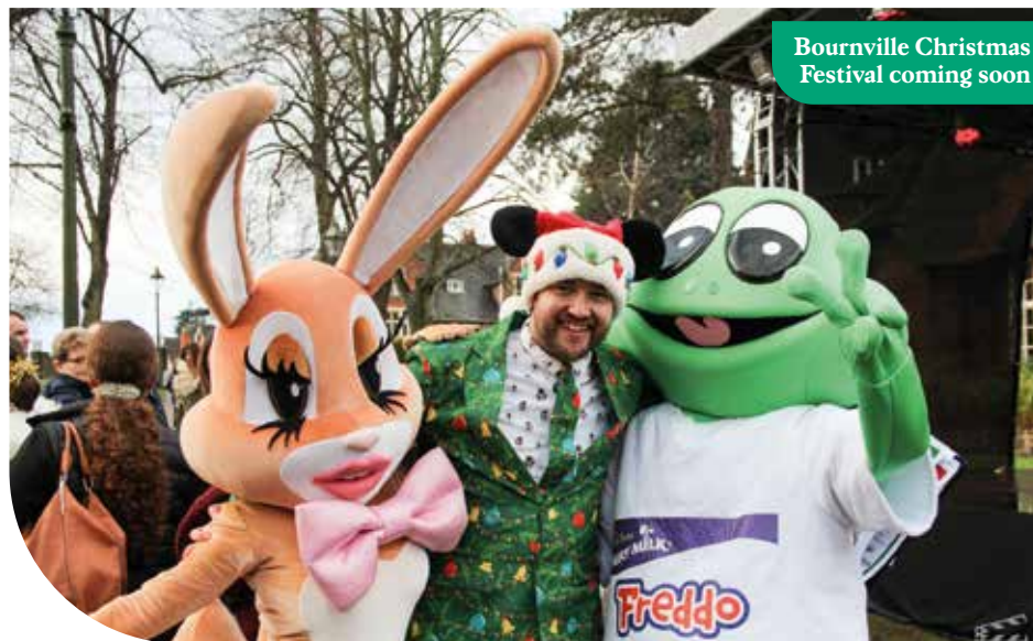
Bournville Christmas Festival coming soon

To speak to our Estates and Stewardship team in Lightmoor, please visit the Oak Tree Centre Mon-Fri 9am-5pm, call 01952 898524 or email lightmoorstewardship@bvt.org.uk and to arrange an appointment with our Housing team, visit reception at Bournville House (Mon-Fri 9am-5pm), call 0300 333 6540 or email enquiries@bvt.org.uk