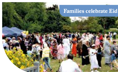
Families celebrate Eid

Are you part of a group or faith who would like to work with us to host an event in our grounds? Please email communityadmin@bvt.org.uk or call 0300 333 6540 and ask for our community team.