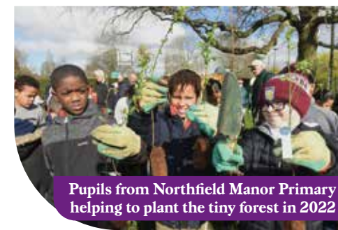
Pupils from Northfield Manor Primary helping to plant the tiny forest in 2022

If you're interested in becoming a volunteer tree keeper, please email tinyforest@earthwatch.org.uk